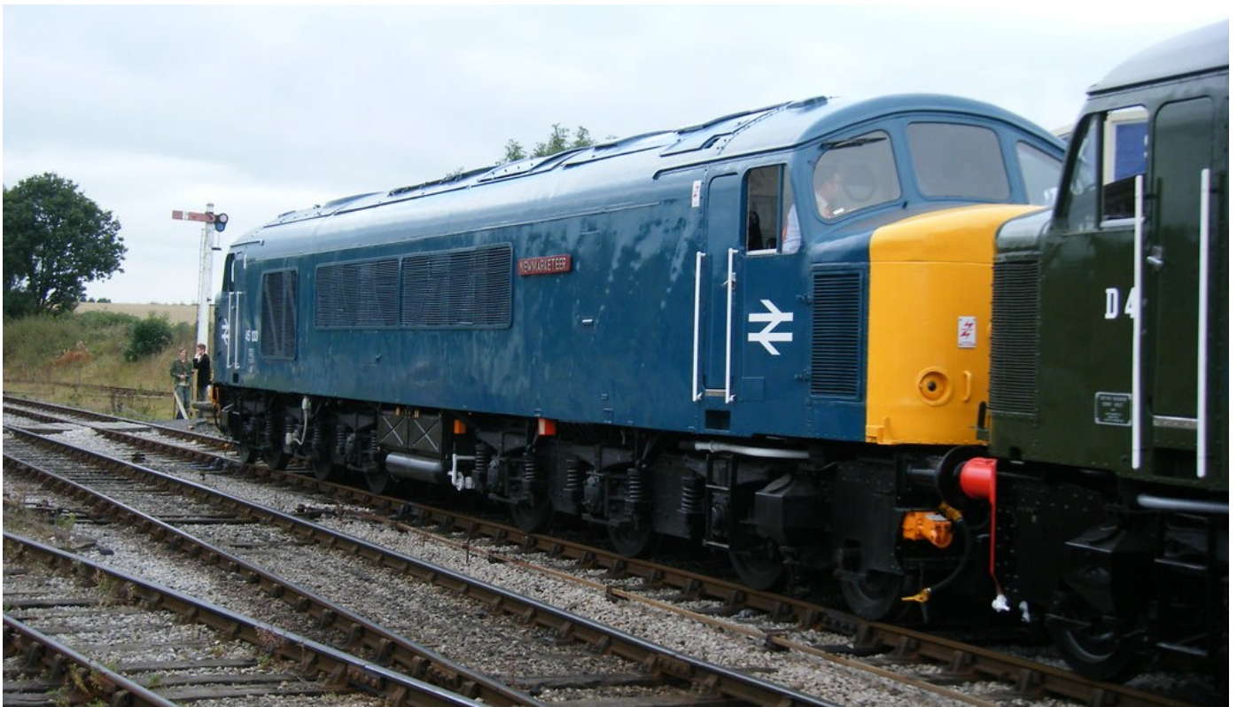
An archive photo of 45133 carrying the 'Newmarketeer' nameplate at Swanwick Jn on 27/09/09.